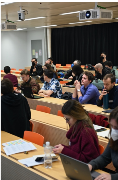
Day 1 – Panel I