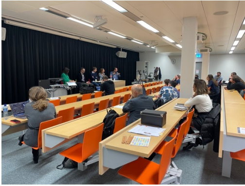
Day 1 – Public roundtable