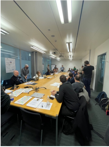
Day 1 – Poster Session